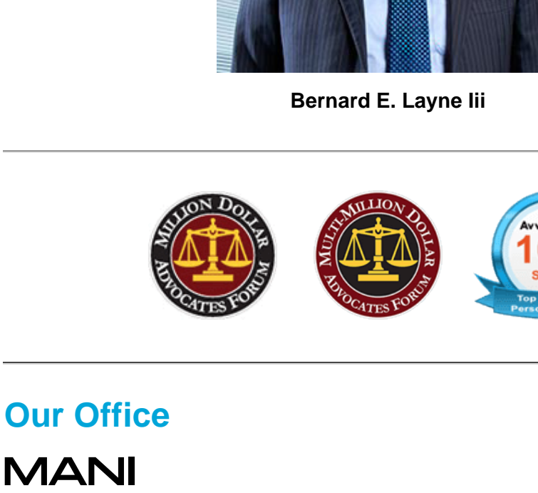
ELLIS & AYNE plic It's not just business.